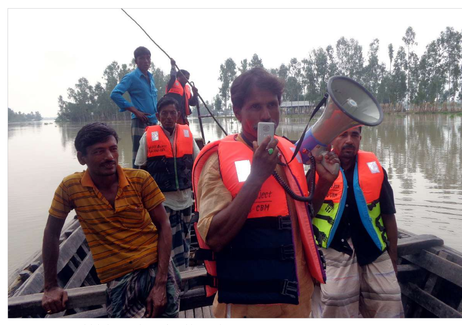
Evacuation in process in Bangladesh.

certainly not with persons with disabilities. Though in some cases specific attention is given to households with disabled persons, such interventions are rare. Moreover, such an approach only addresses accessibility of the house and not the wider societal context in which the person lives. Although an admirable start, such restrictive approaches fall short of achieving the vision of "building back better."