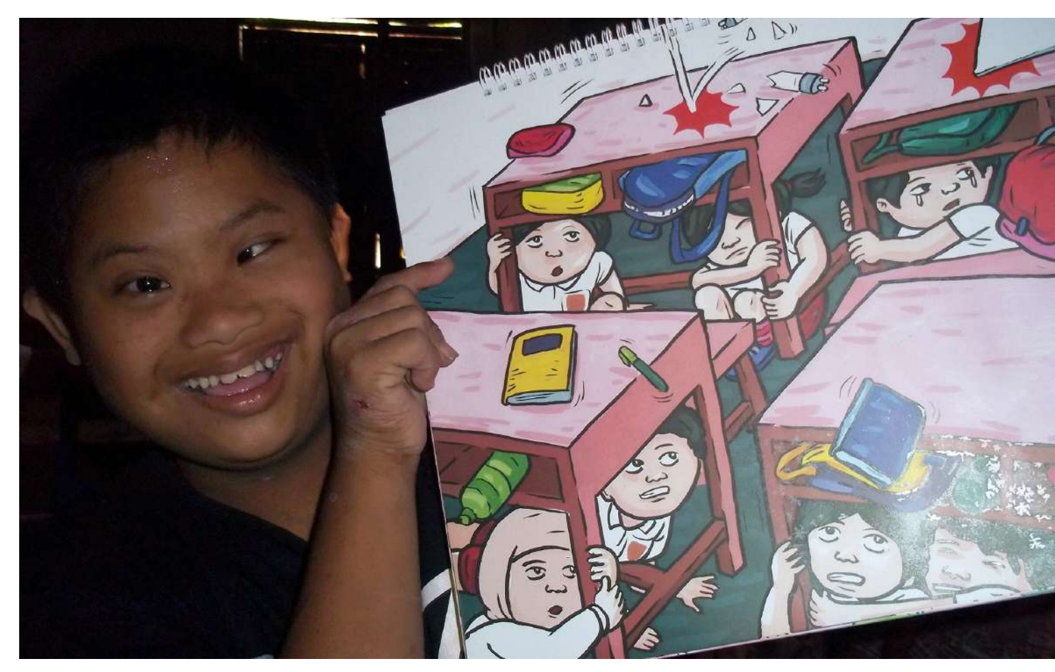
Indonesia: Building resilience for children with disabilities. Disaster Risk Reduction training has to include all members of society, especially the most vulnerable.

unable to find, count, assess, or communicate with persons with disabilities. If DRM personnel do not see any persons with disabilities, it can lead to the assumption that "there are no persons with disabilities," or that "all persons with disabilities must have died," excluding persons with disabilities from DRM activities, including relief and recovery efforts.