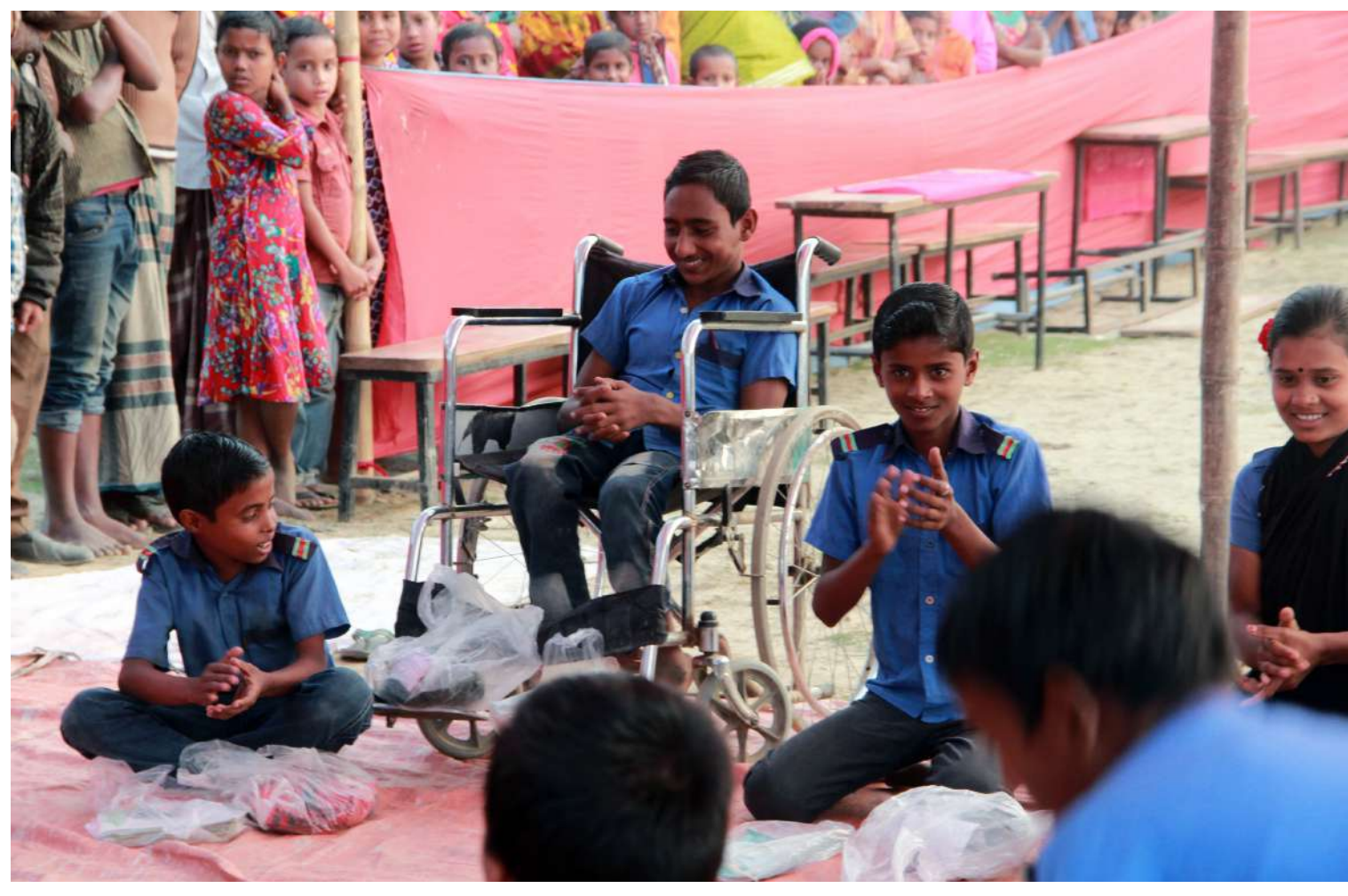
Children participate in a mock drill.

ENHANCE staff expertise. In addition to consultations with the World Bank's Global Disability Advisor as appropriate, and ensuring that there is a corps of staff available for internal "just in time" consultation (including staff with disabilities), guidance notes and other training, information, and professional development tools should be made available to guide staff in ensuring that DRM-related projects incorporate disability from the earliest phases onwards.